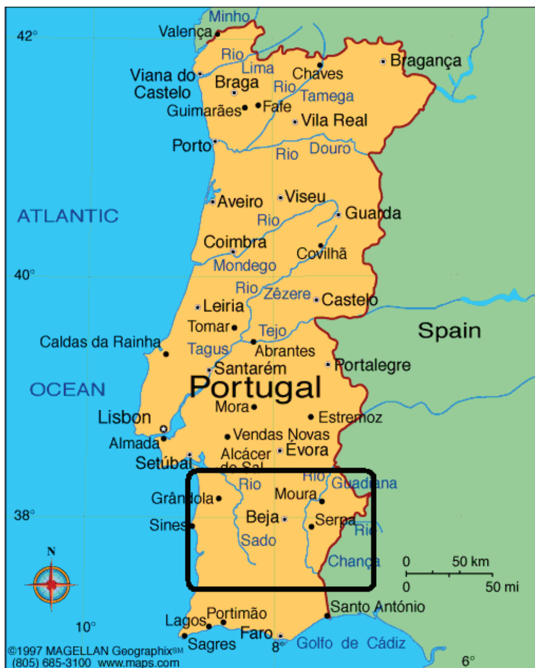
Figure 2. The territory under the direct influence of the IPBeja

The Polytechnic Institute of Beja (IPBeja) is located in Beja, the capital of Baixo Alentejo region and has as direct influence in the geographical areas called Baixo Alentejo and Alentejo Litoral. The IPBeja is the only public HEI in the region.